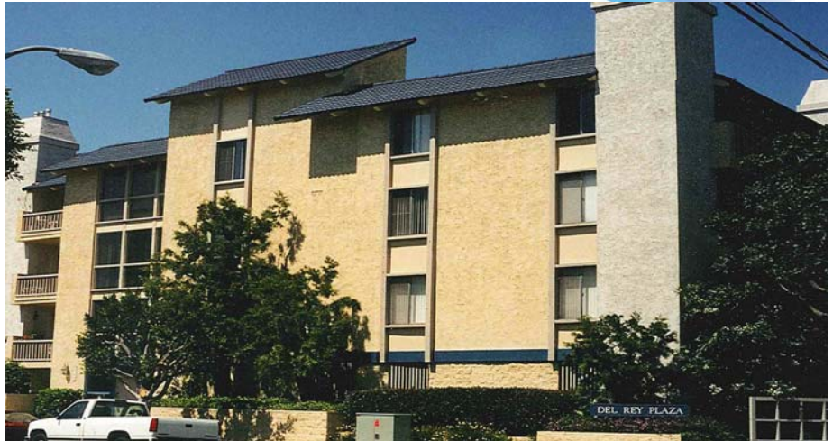
Multifamily Project, Del Rey Plaza in Los Angeles. One of several related projects totaling over 900 units, with BV150 Blending Ventilators.

In 1999 the FAA spent $241 million on noise mitigation around U.S. airports, and the federal funds earmarked for these programs are increasing. While the programs are federally funded, local port commissions and municipalities usually administer them. The process may vary in different municipalities, but the private sector usually handles the design work and the municipality or private consultants provide construction management and program administration. The construction work is then contracted out to local construction companies.