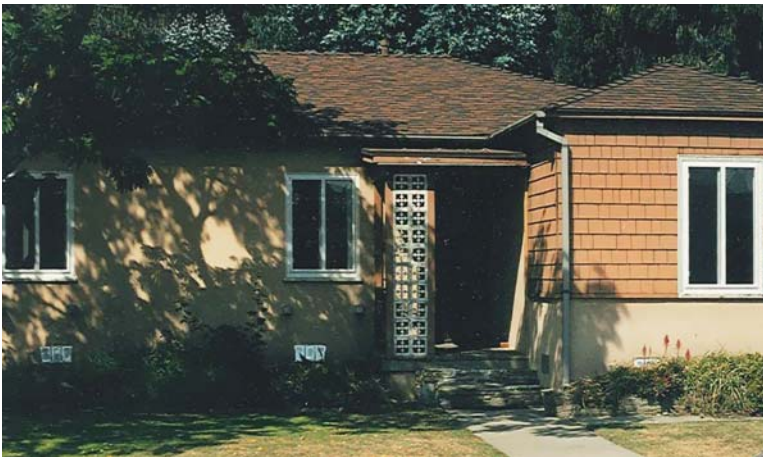
Single Family Project. Typical two-bedroom, single-family project near LAX with BV150 Blending Ventilator